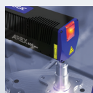
Laser Marking Systems