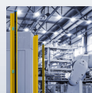
Safety Light Curtains