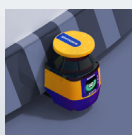
Safety Laser Scanner