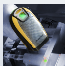
Hand Held Scanners