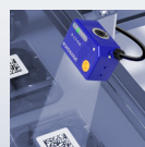
Stationary Industrial Scanners